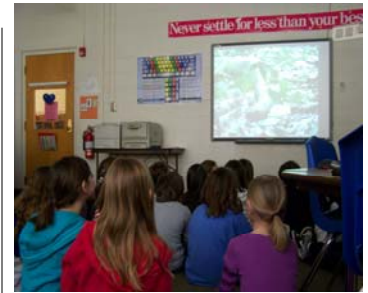
Students enjoying a virtual field trip to the Buffalo Zoo.