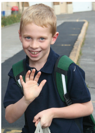
All set and excited to be back!